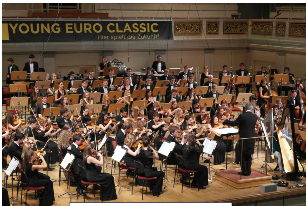
Performance at the Konzerthaus, Berlin